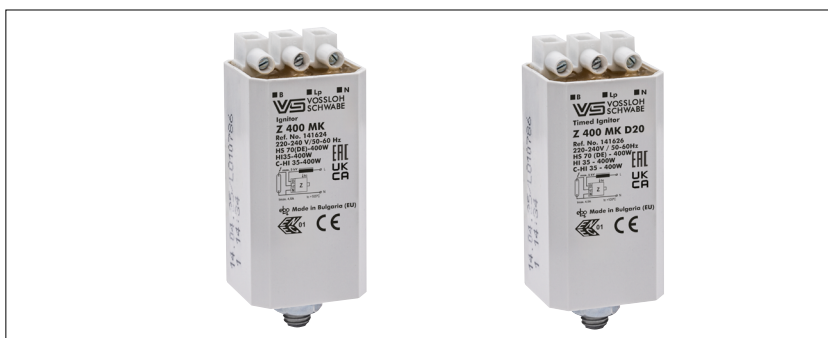
PC casing – K and K D20

Standard version or with automatic switch-off Compact shape For high pressure sodium lamps (HS), metal halide lamps (HI) and ceramic discharge lamps (C-HI) Ignition voltage: 3.0-5.0 Phasing of the ignition voltage: 60–90 °el and 240–270 °el Max. permitted casing temperature: 105 °C Fastening: male nipple with pre-assembled washer and nut For luminaires of protection class I and II