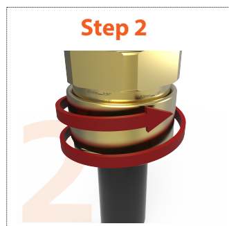
Tighten backnut until a seal is formed onto the cable, then tighten one further turn