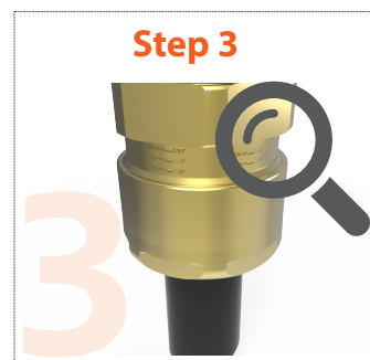
The backnut should be level with the marking guide corresponding to its diameter – this can be visually inspected and adjusted as necessary