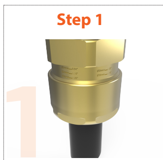
Follow cable gland installation instructions until final stage – tightening of rear seal

The gland is permanently marked with various lines/numbers indicating the correct tightening level related to the cable diameter. Following the relevant cable gland Installation Instructions, the back seal should be tightened until a seal is formed on the cable outer sheath and then tightened one further turn.