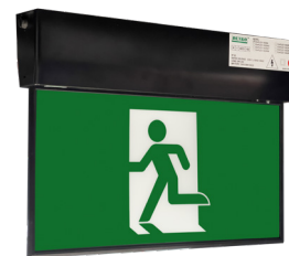
EmFLEX 1602RM (B)