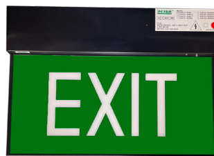
EmFLEX 1602M (B)